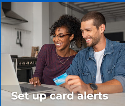
Set up card alerts